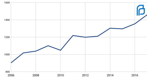
Ultimately , incrementalism does more harm than good.